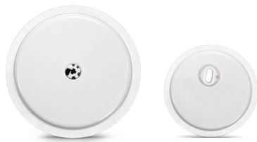
One (1) FreeStyle Libre 2 Plus or FreeStyle Libre 3 Plus sensor